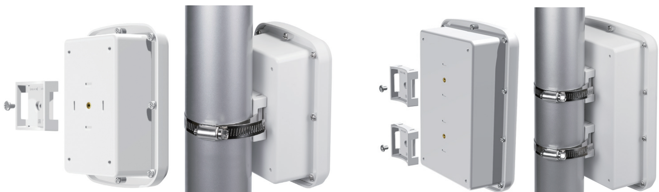
Installation (2 pcs)