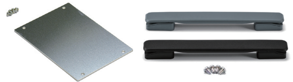
Mounting plate UCC series See page 261