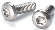
Head type (with pin)