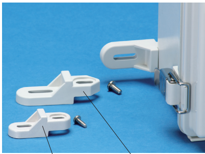
Color G Color S