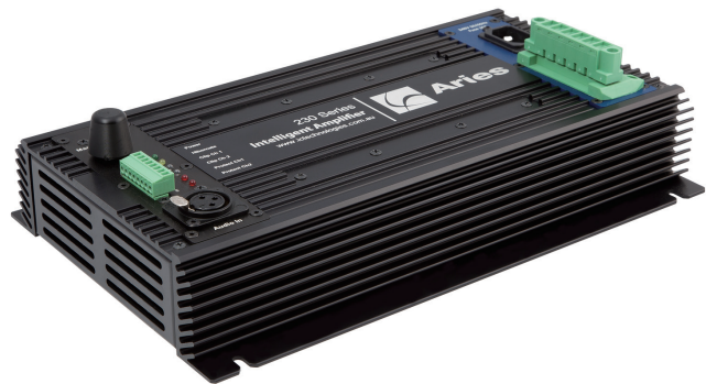
Product by: IC Technologies (Australia)