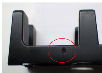
Injection Molding Gate on the side