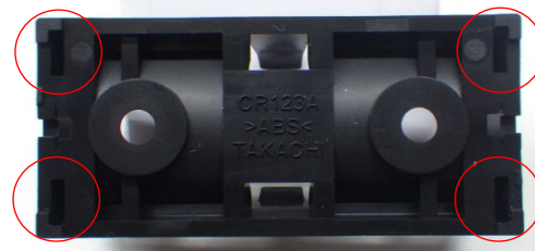
Addition of holes/gaps at 4 corners