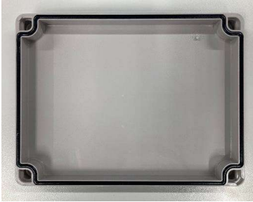
Current (Old) Design