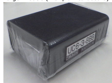
Smaller Models (without cardboard)