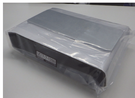
Larger Models (with plain cardboard)